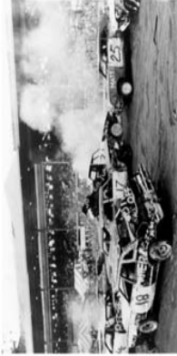
WORLD'S LARGEST DEMOLITION DERBY JM PRODUCTIONS INC 4751 SOUTHWESTERN BLVD. HAMBURG, NY 14075-5017 FAX 802-648-5292

For Ticket Information call the Champlain Valley Fair Office at (802) 878-5545