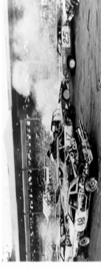
WORLD’S LARGEST DEMOLITION DERBY JM PRODUCTIONS, INC. 4751 SOUTHWESTERN BLVD., HAMBURG, NY 14075-1006 (716) 648-5100