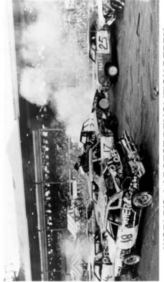
WORLD'S LARGEST DEMOLITION DERBY

J.M. PRODUCTIONS, INC. 4751 SOUTHWESTERN BLVD. HAMBURG, NY 14075-1926 (716) 648-5100